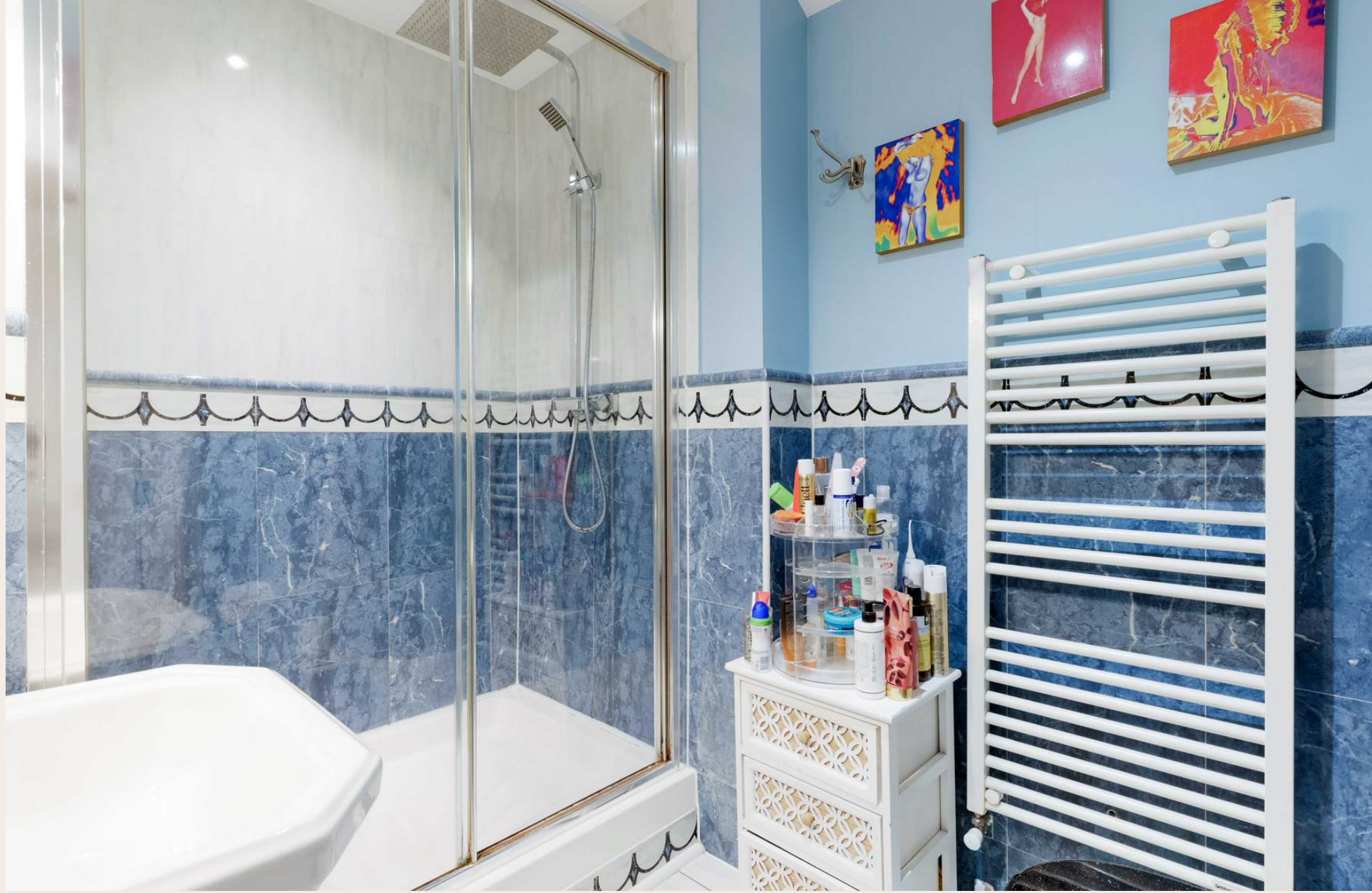
9 MERYTON HOUSE, LONGBOURN, WINDSOR