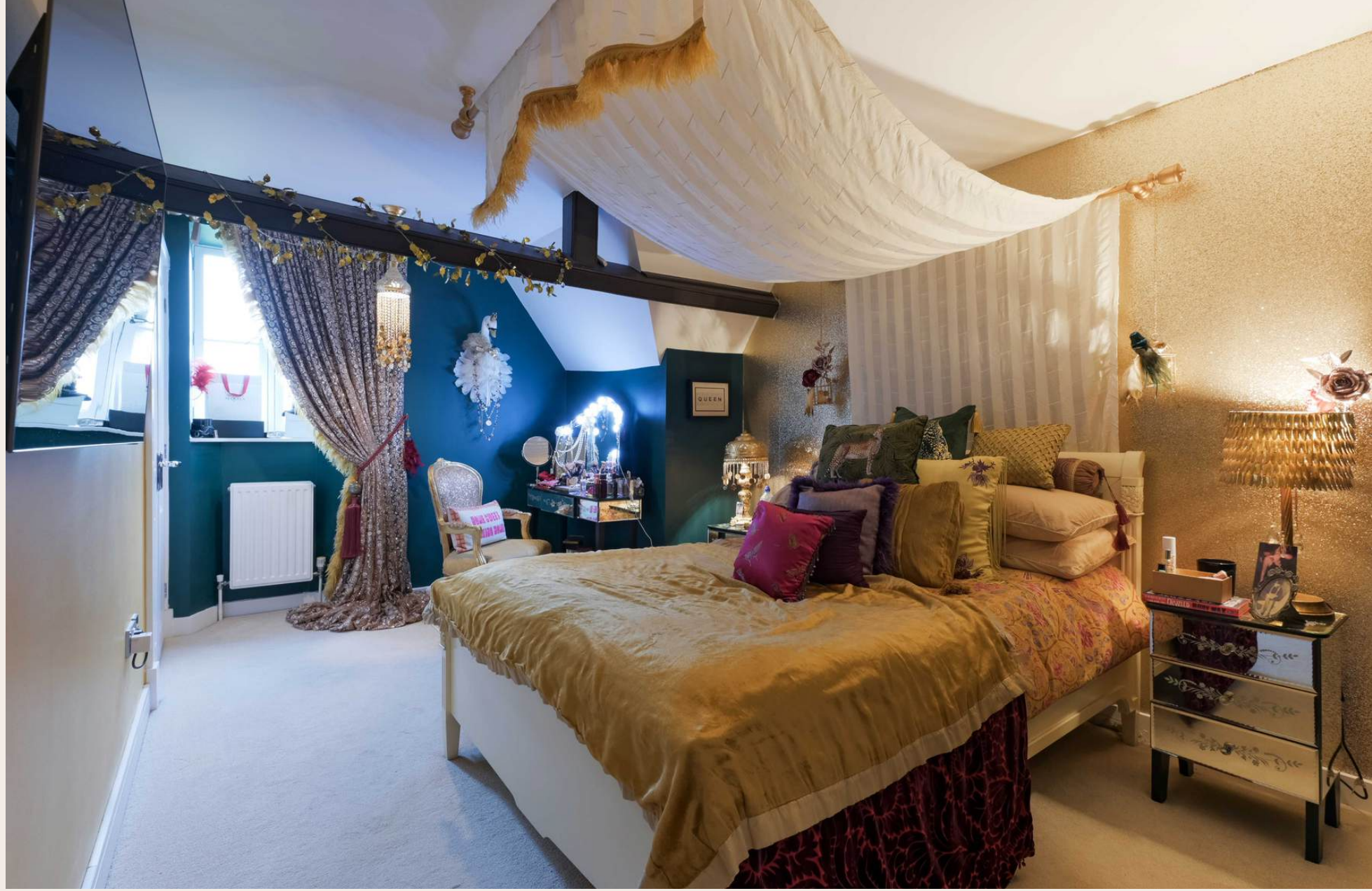
9 MERYTON HOUSE, LONGBOURN, WINDSOR