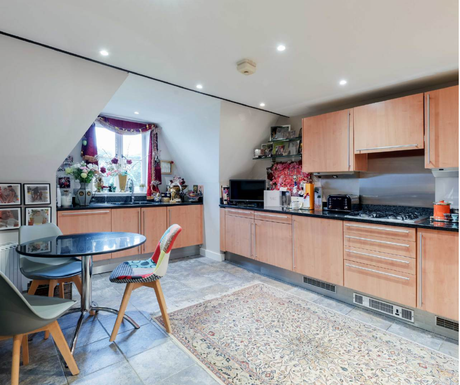
9 MERYTON HOUSE, LONGBOURN, WINDSOR