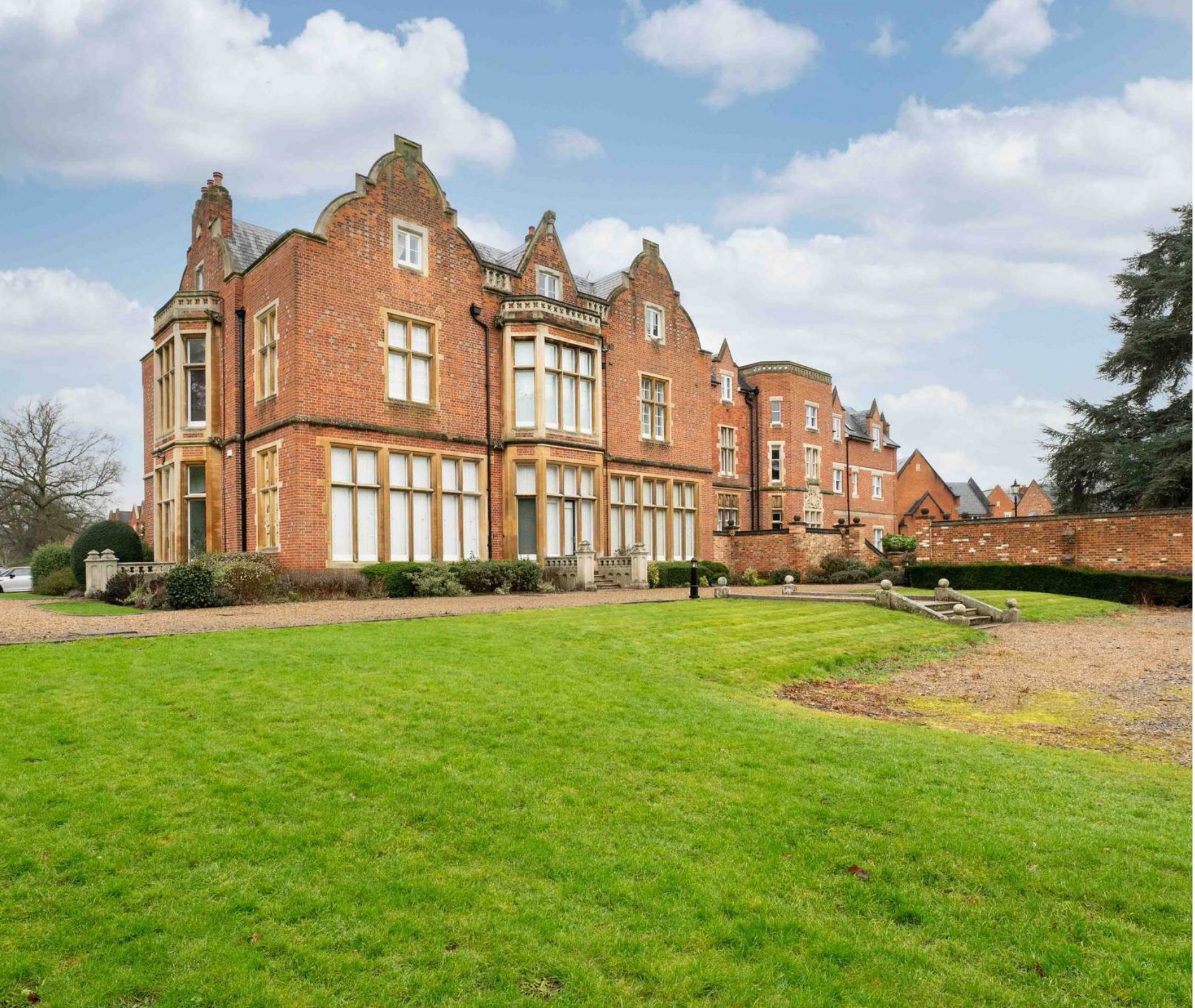
9 MERYTON HOUSE, LONGBOURN, WINDSOR