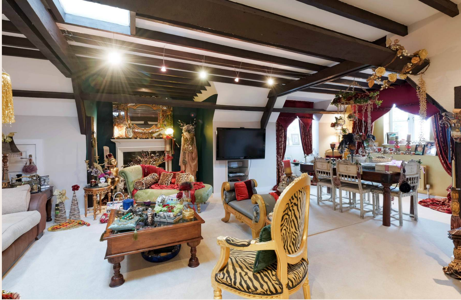
9 MERYTON HOUSE, LONGBOURN, WINDSOR