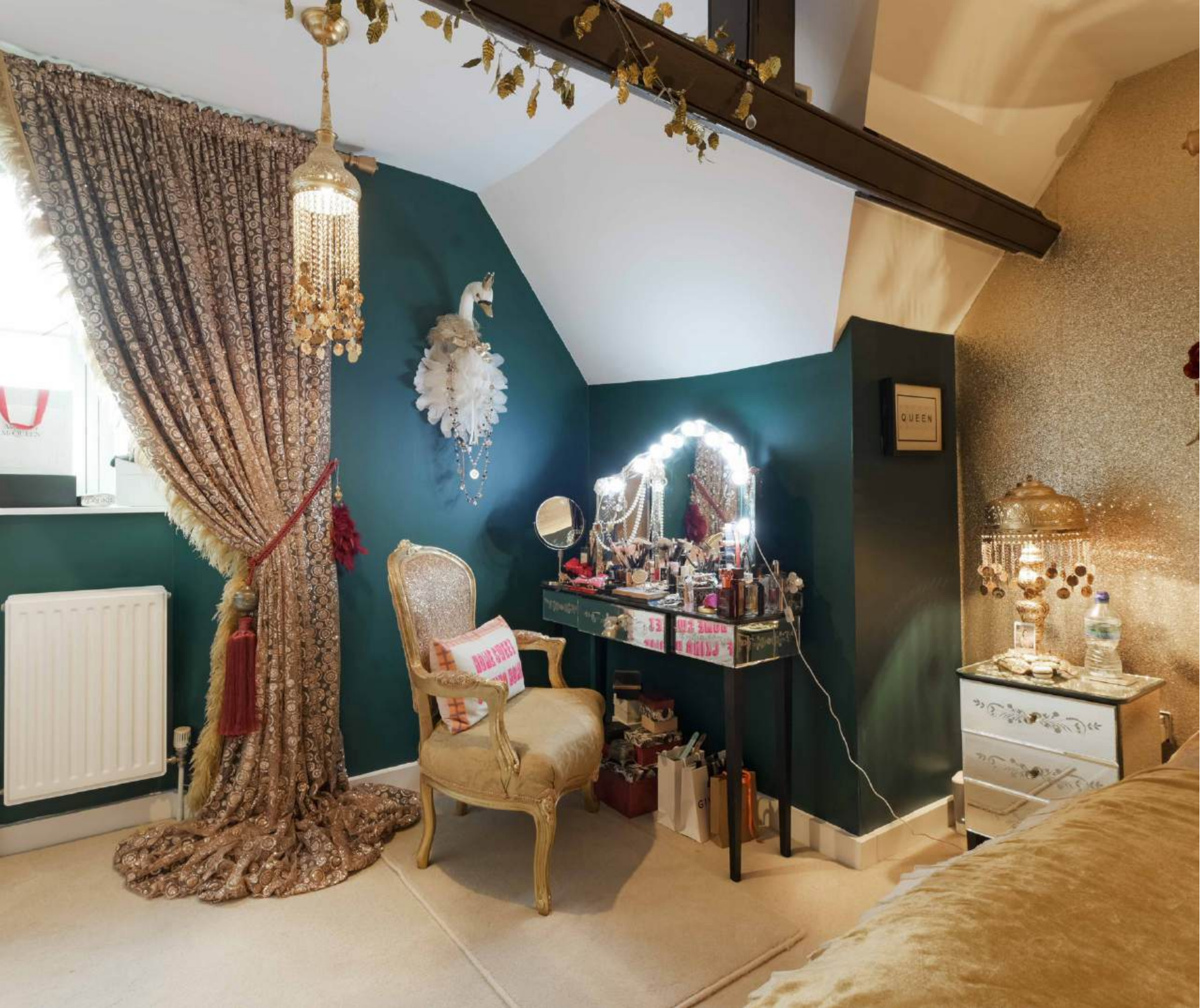
9 MERYTON HOUSE, LONGBOURN, WINDSOR