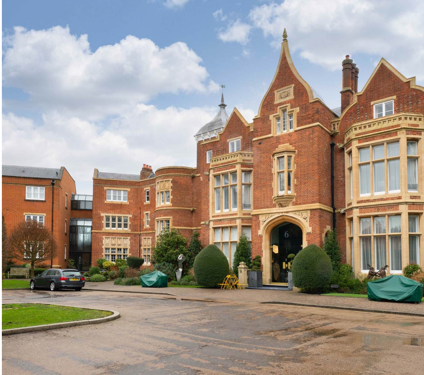
9 MERYTON HOUSE, LONGBOURN, WINDSOR