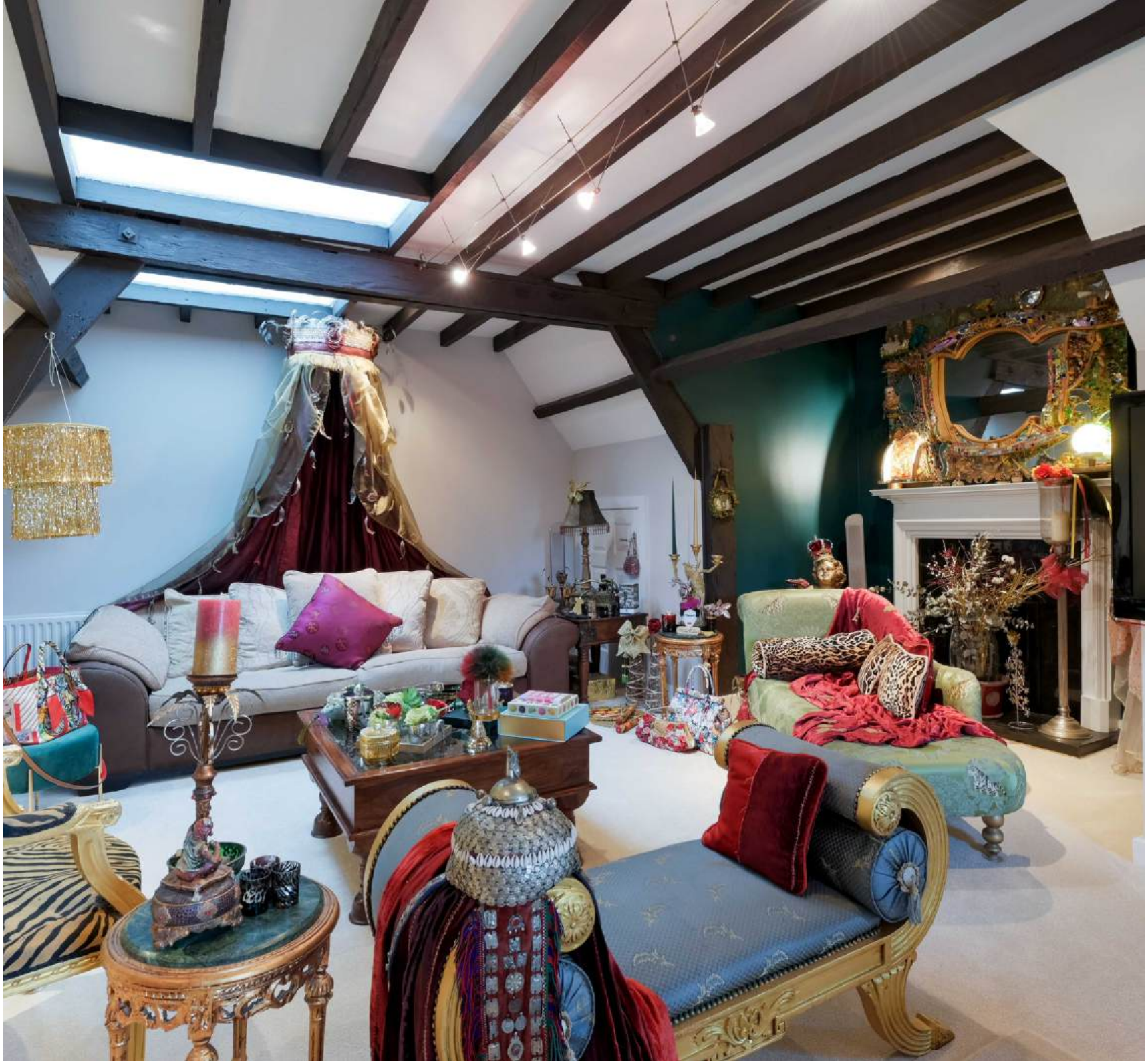
9 MERYTON HOUSE, LONGBOURN, WINDSOR