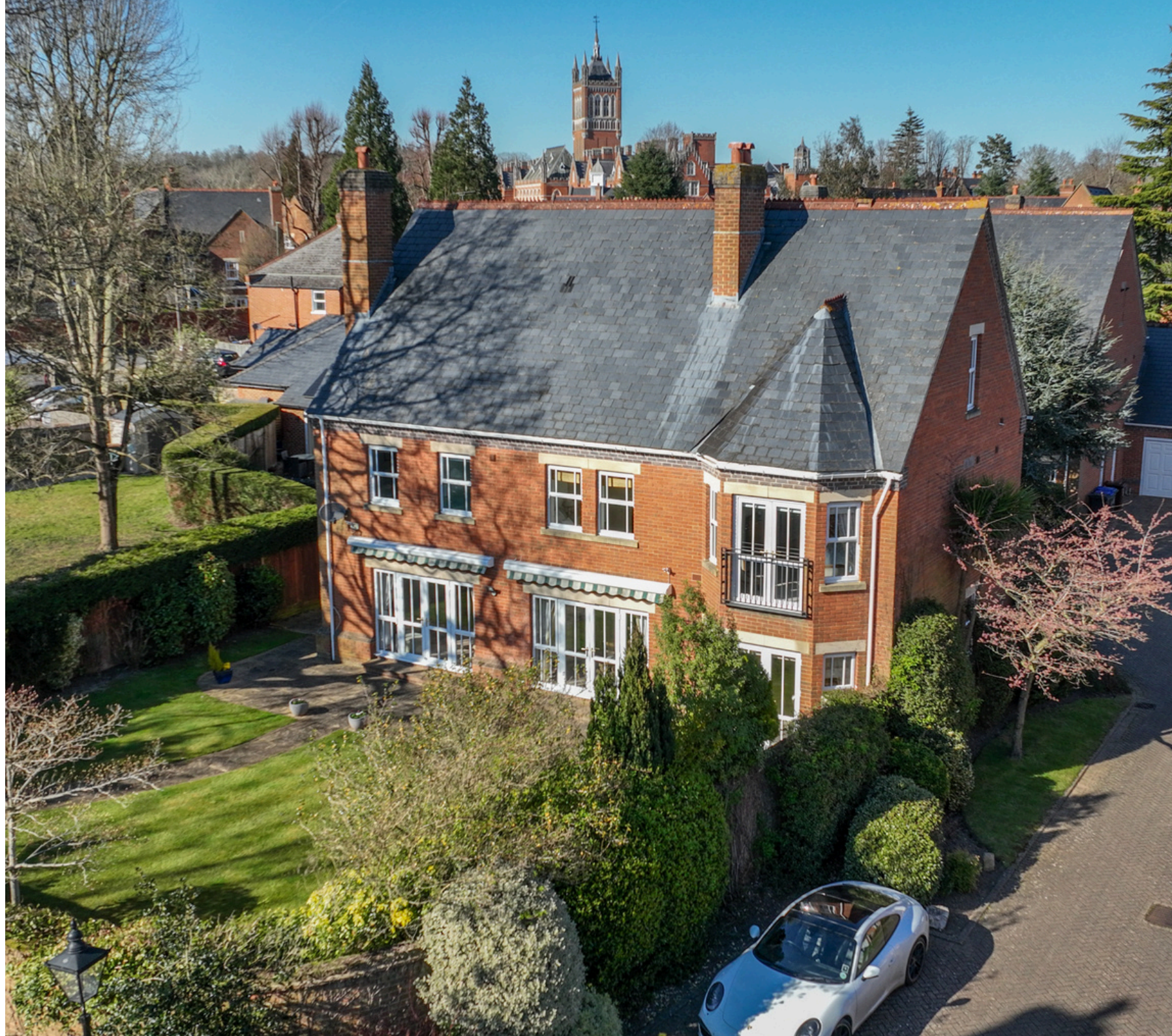
11 RIDGE WAY, VIRGINIA WATER