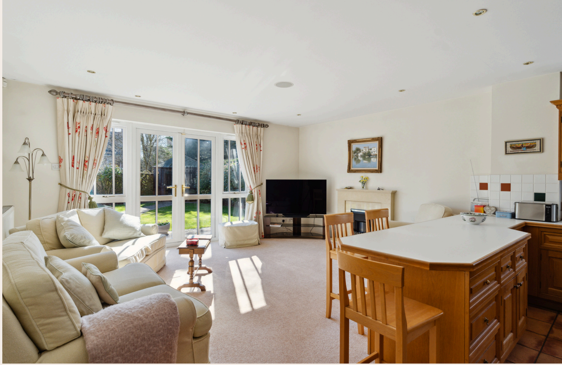
11 RIDGE WAY, VIRGINIA WATER