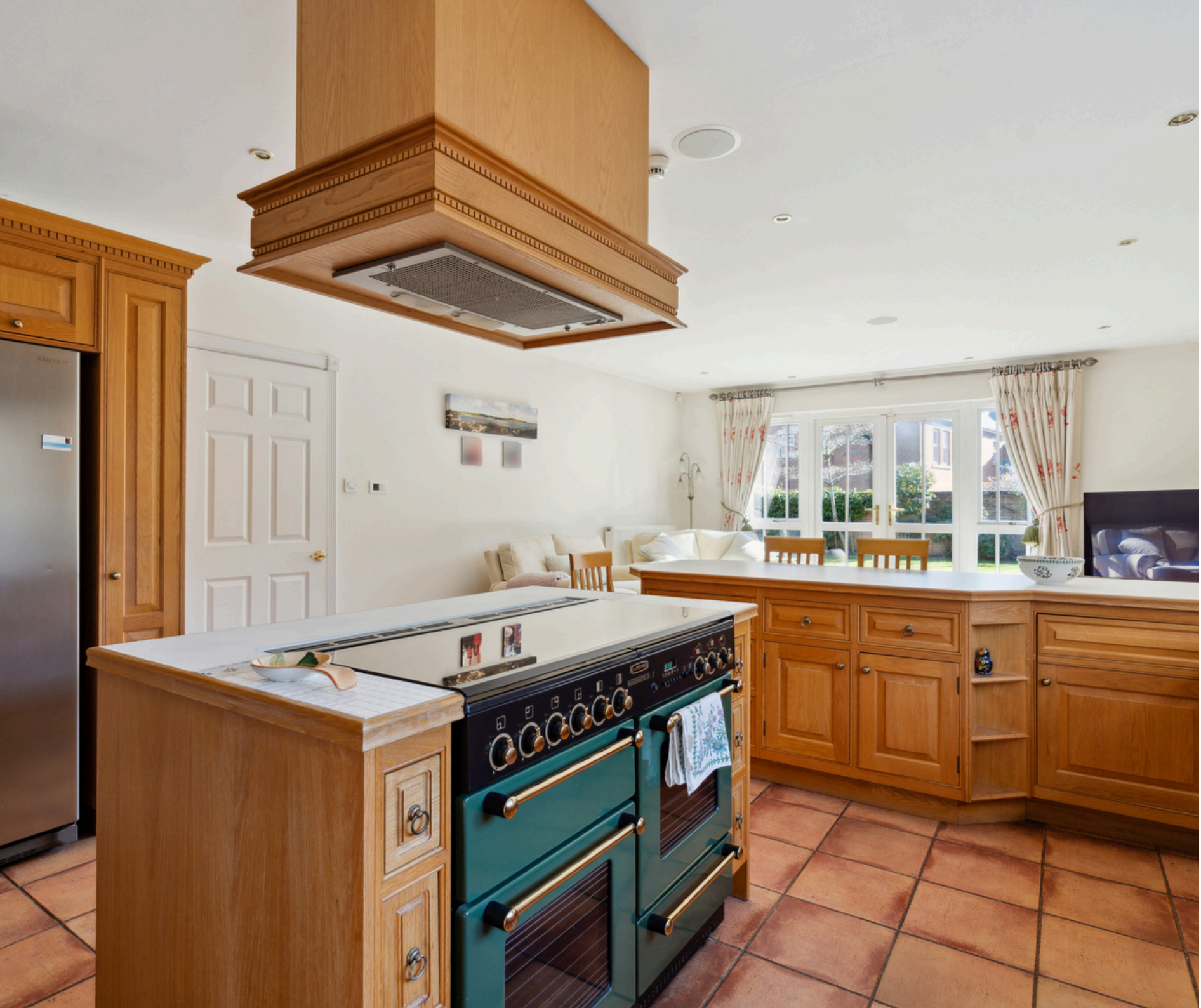
11 RIDGE WAY, VIRGINIA WATER