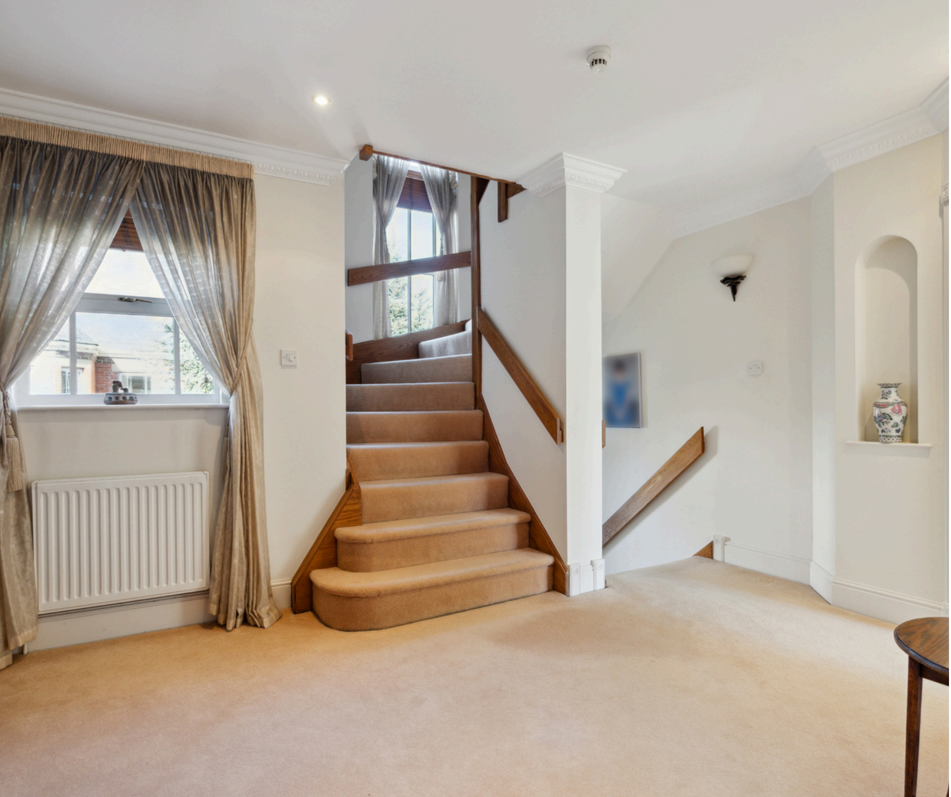
11 RIDGE WAY, VIRGINIA WATER