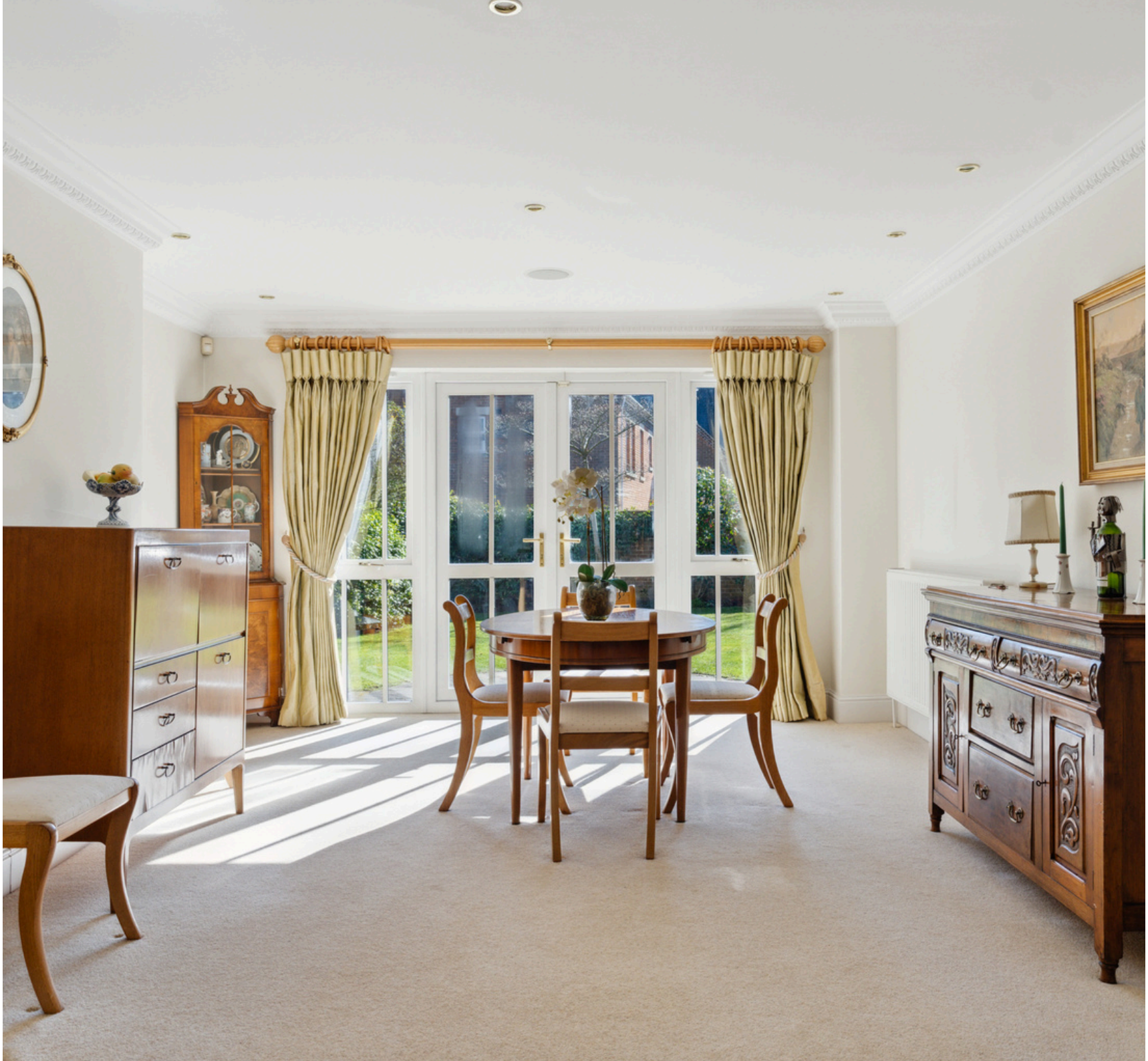
11 RIDGE WAY, VIRGINIA WATER