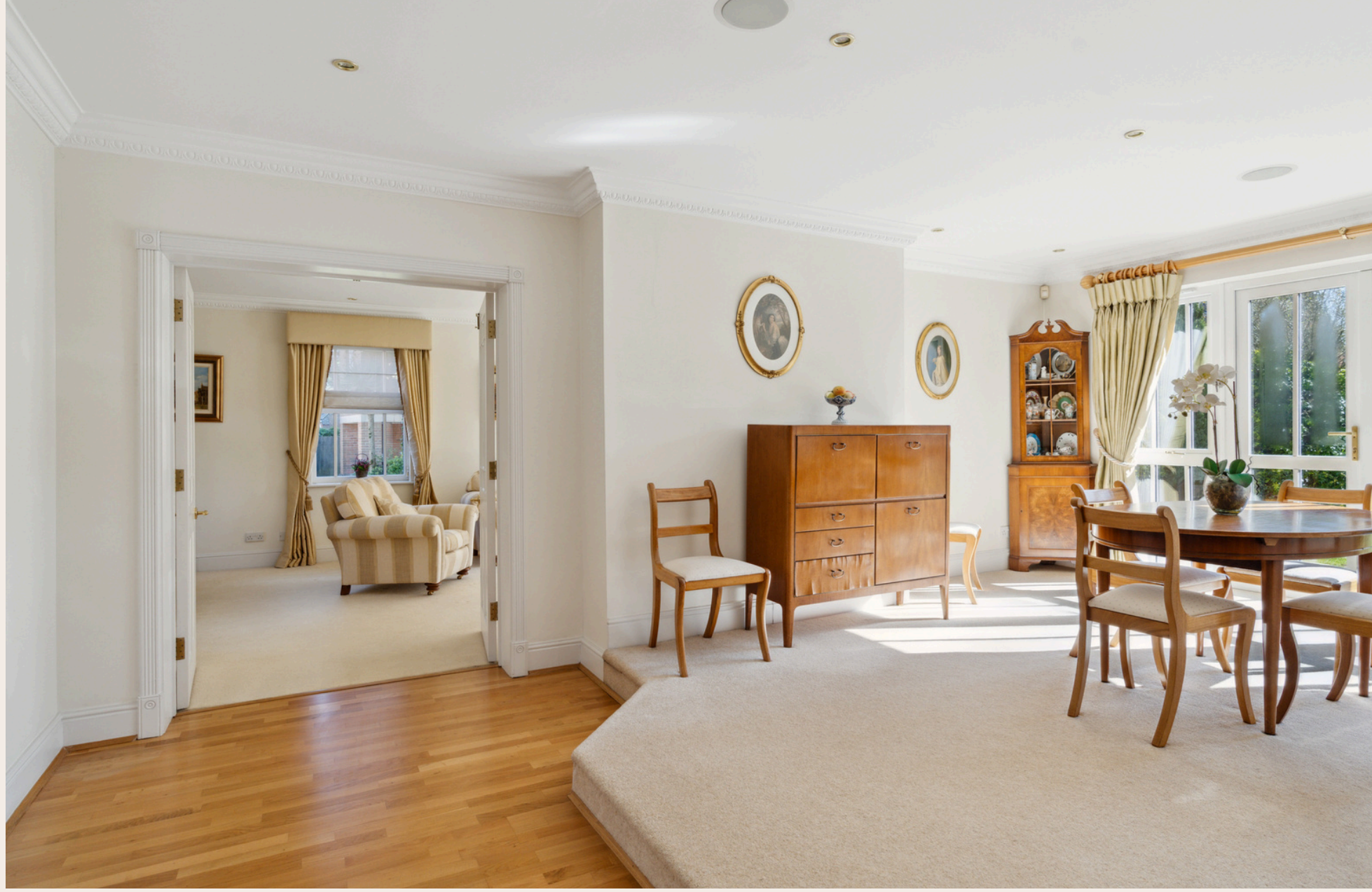
11 RIDGE WAY, VIRGINIA WATER